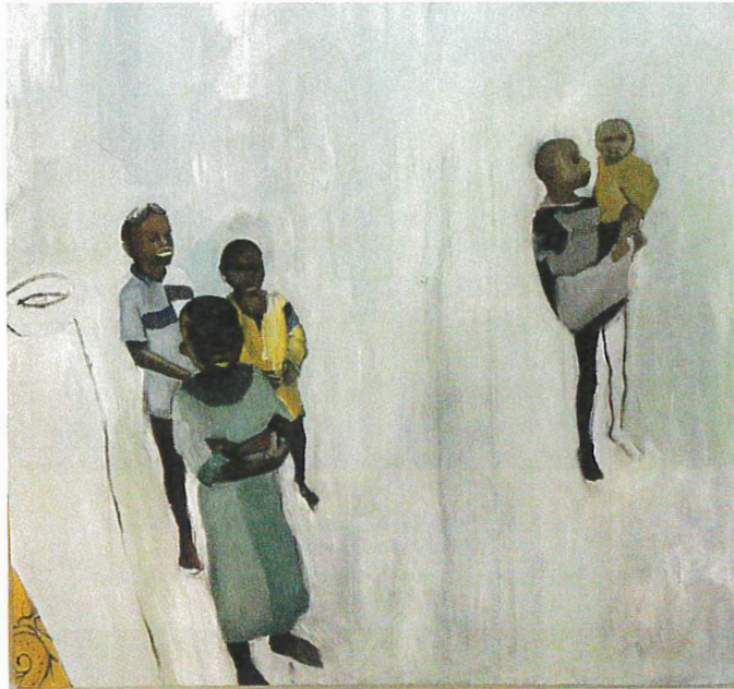
DIMEJI ONAFUWA, OMOLOMO (SOMEONE ELSE'S CHILDREN), 2020, OIL ON CANVAS, 48 X 48 X 0.5 INCHES. IMAGE COURTESY OF DIMEJI ONAFUWA AND SOZO GALLERY