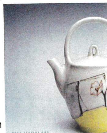
PHIL HARAI AM

200 N. DAVIE STREET • GREENSBORO, NC 27401