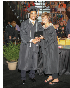
1 - 8x10