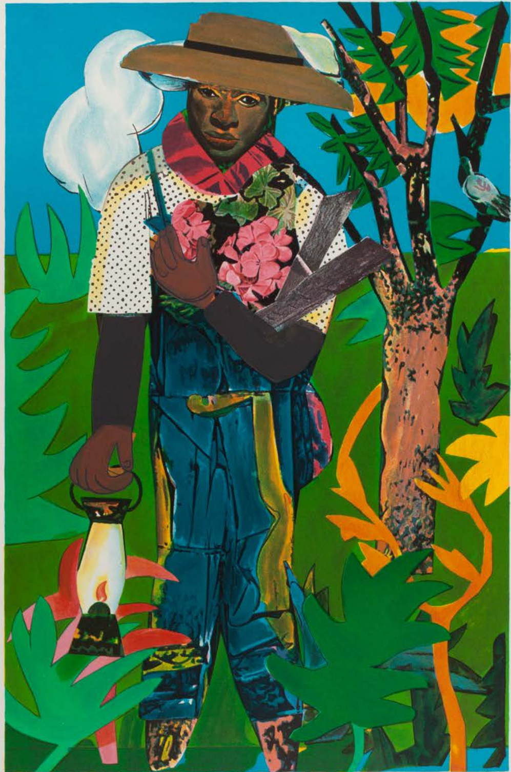
Romare Bearden, The Lantern , 1979, lithograph, image 23 5/8 x 15 3/8 inches | Art © Bearden Foundation/Licensed by VAGA, New York, NY